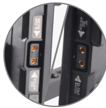
V-lock battery mount comes with two B interface at the both sides