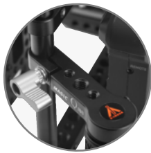
Covers with multiple 1/4" and 3/8" mounting threads