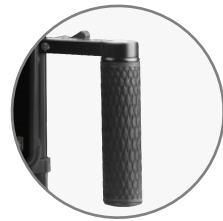
Comfortable, adjustable rubber handgrips allow for portability

E-image Q100 TWIN is designed to fit two monitors up to 9" ,featuring rubber handgrips, a padded neck strap, and V-LOCK battery mount with dual-B interfaces, covers with multiple 1/4" and 3/8" mounting threads, this cage makes carrying monitors and accessories simple and comfortable.